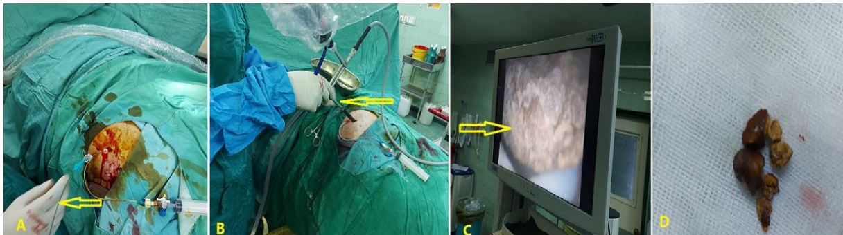
Figure 2: minimally invasive percutaneous nephrolithotomy with ultrasonography guidance showing: A) the J-tipped guidewire insertion into the aimed calyx (arrow); B) the rigid nephroscopy (arrow); C) the stone on the monitor (arrow); D) the removed stones